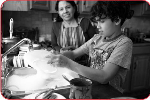
I do the dishes.

see my friends have dinner walk the dog do my homework tidy my room do the dishes